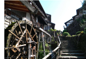
Magome-juku old town