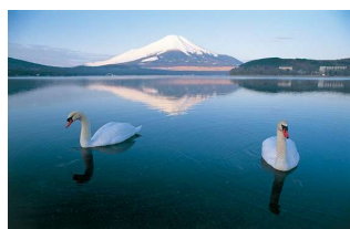
Lake Yamanaka with Mt.Fuji