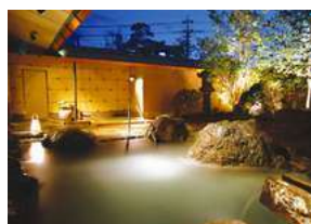
Isawa Spa Ryokan