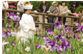
Iris festival @ Itako