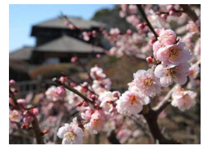
Plum fes @ Kairaku-en park