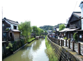
Sawara riverside old town