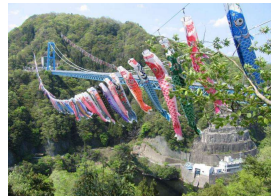
Carp streamers @ Ryujin suspension bridge Nikko Toshogu